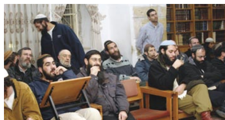
Late night Emergency Meeting in the Avraham Avinu Synagogue

The story of the modern-day return to Hebron is fraught with ups and downs. While right now we are struggling to accommodate the displaced families, we succeeded in preserving our property and getting government recognition of Jewish rights in the area. If the past is any indication, we will soon find ourselves back in the Mitzpe Shalhevet neighborhood with the Jewish community in Hebron bigger and stronger than ever! ■