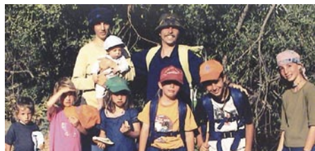
The Bar Kochva Family- still on the move, looking for a permanent home.

Suddenly, nine families found themselves